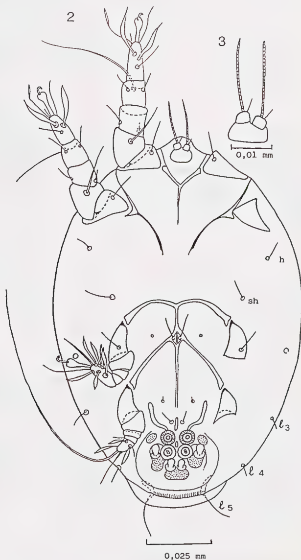
Figs 2-3. Psylloglyphus foveolatus , hypopus: (2) in ventral view; (3) palposoma enlarged.

diameter, posterior ones 7\mu\text{m} . Setae h , sh , l3 and l4 are 5\text{--}8\mu\text{m} long and set ventrad; l5 12\mu\text{m} long. Palposoma (Fig. 3): Typical for genus. Legs (Figs 4-8): Tarsi I-III with small claws 3.6\mu\text{m} long, its peduncle 8.5\mu\text{m} long (from tip of tarsus to base of claw); tarsus IV ending in a